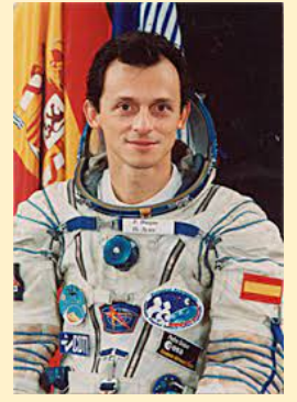
Pedro Duque Astronaut and aeronautics