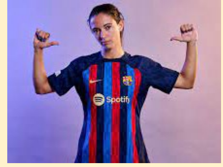
Aitana Bonmatí Football player