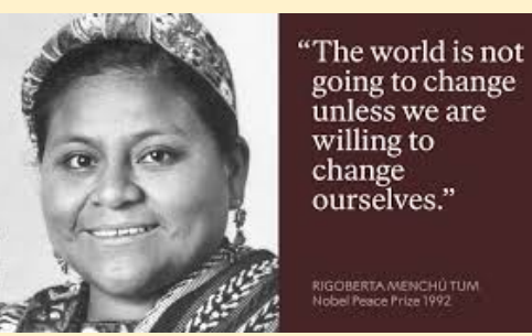
Rigoberta Menchú Human rights activits, feminist and Nobel prize laureate