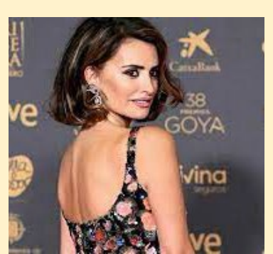
Penélope Cruz Actress