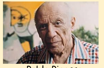
Pablo Picasso Painter, sculptor, printmarker